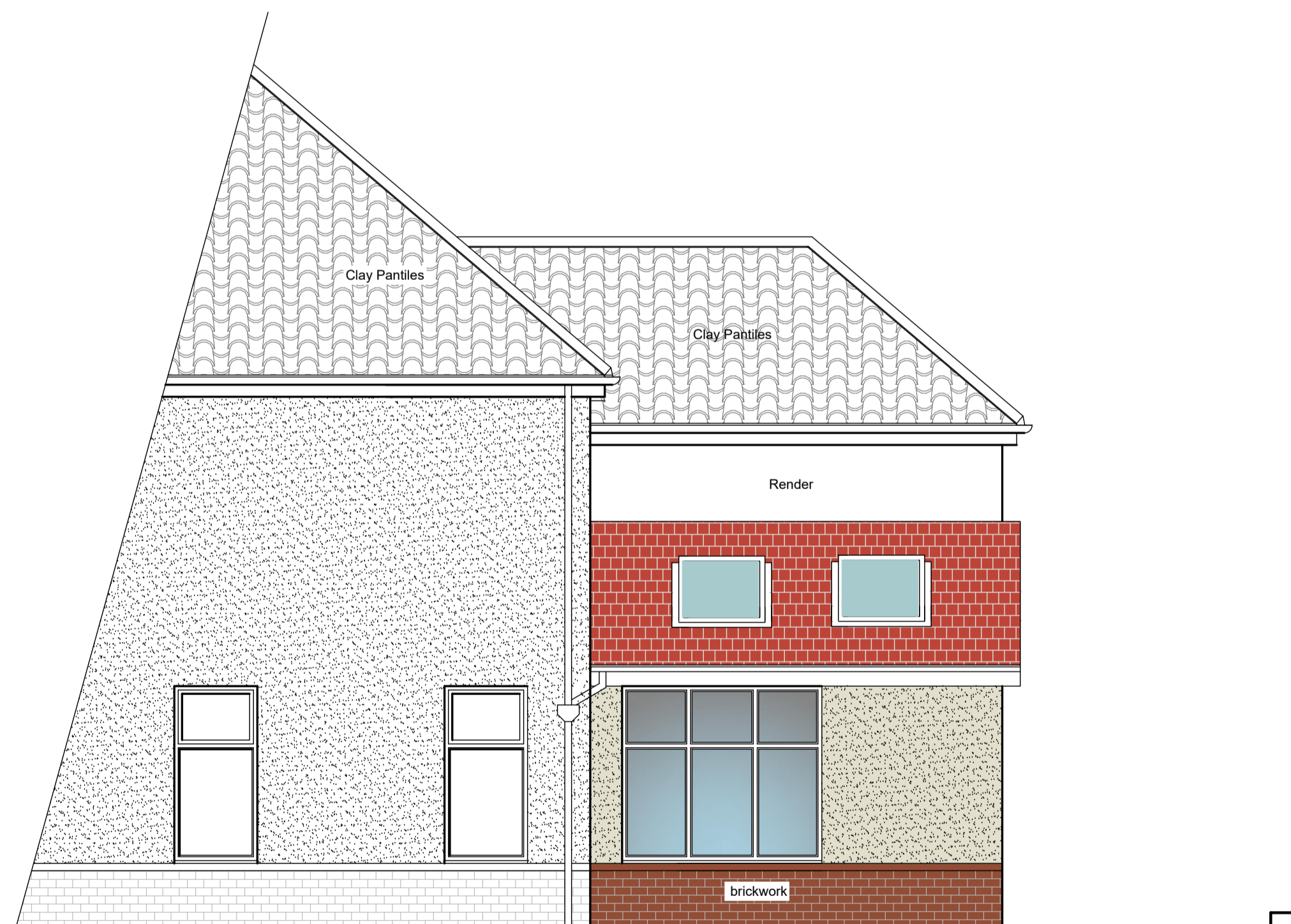
GABLE ELEVATION AS PROPOSED OPTION 4