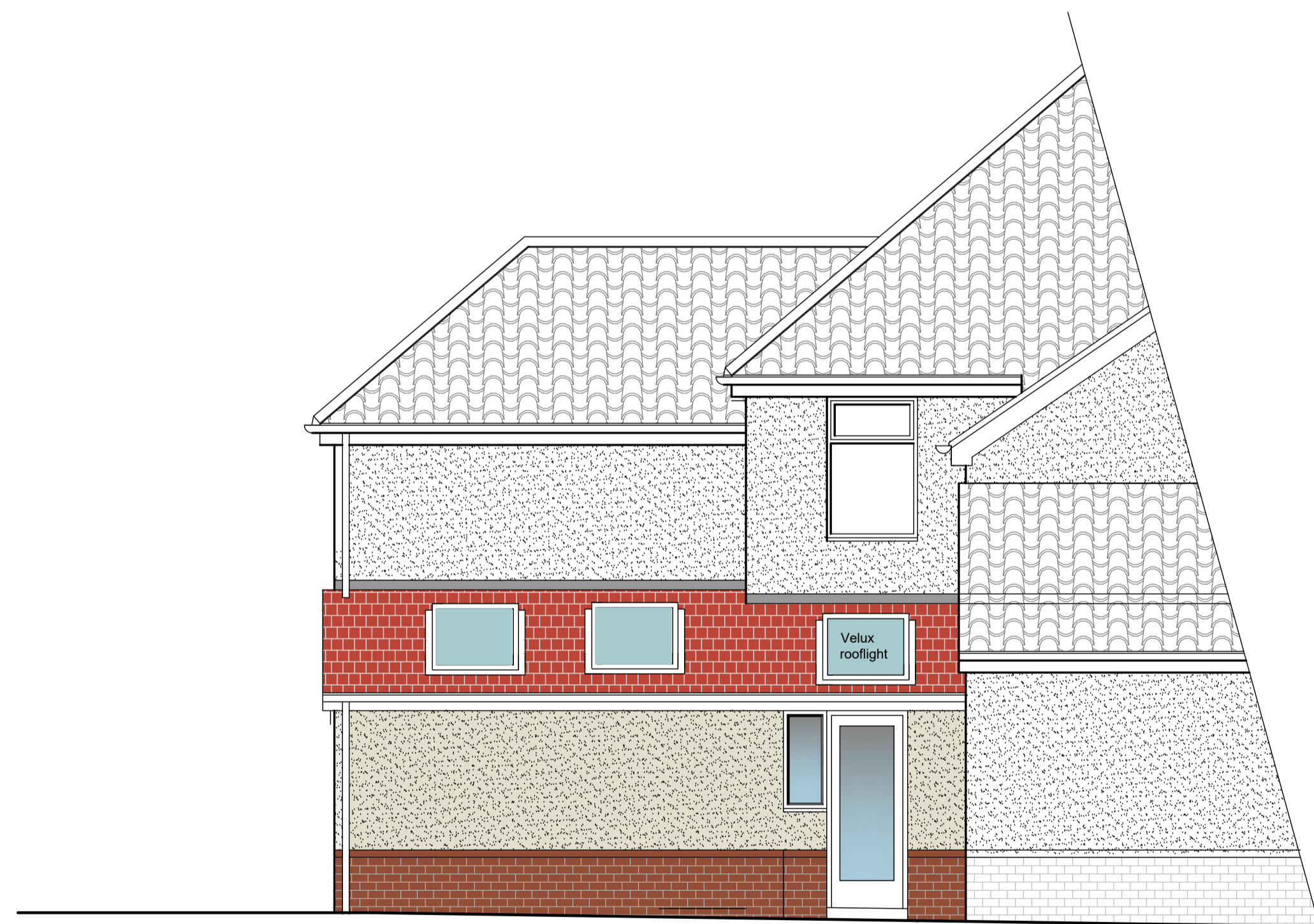
GABLE ELEVATION AS PROPOSED OPTION 4