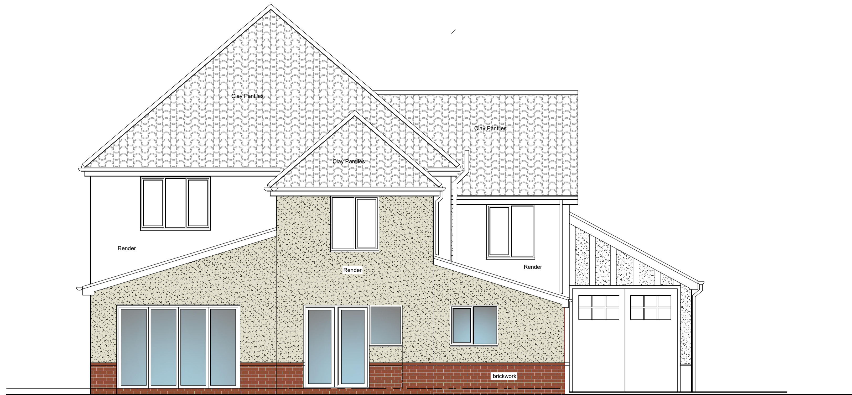
REAR ELEVATION AS PROPOSED OPTION 4