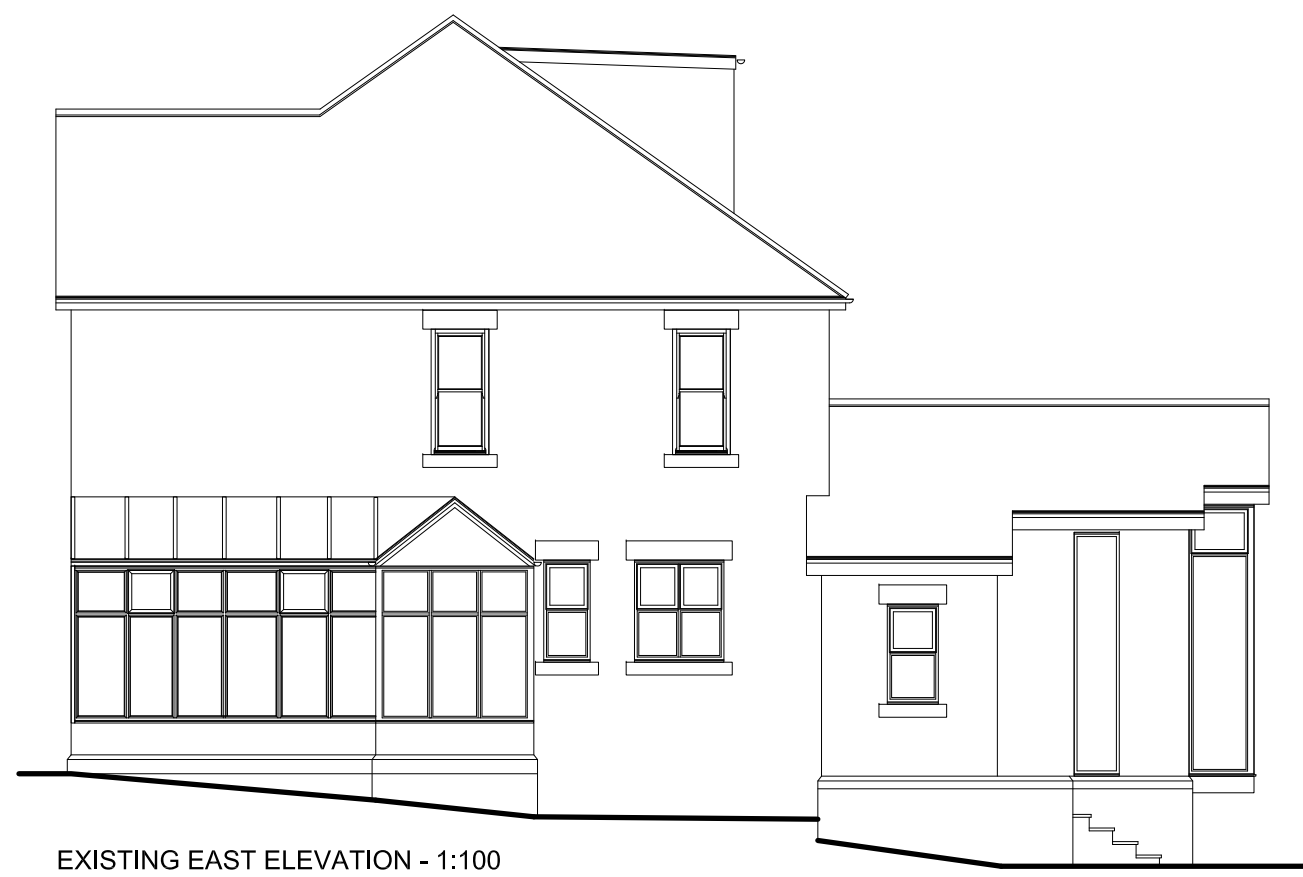
EXISTING EAST ELEVATION - 1:100

New uPVC doors in existing opening, lowering existing cill, retaining sandstone head