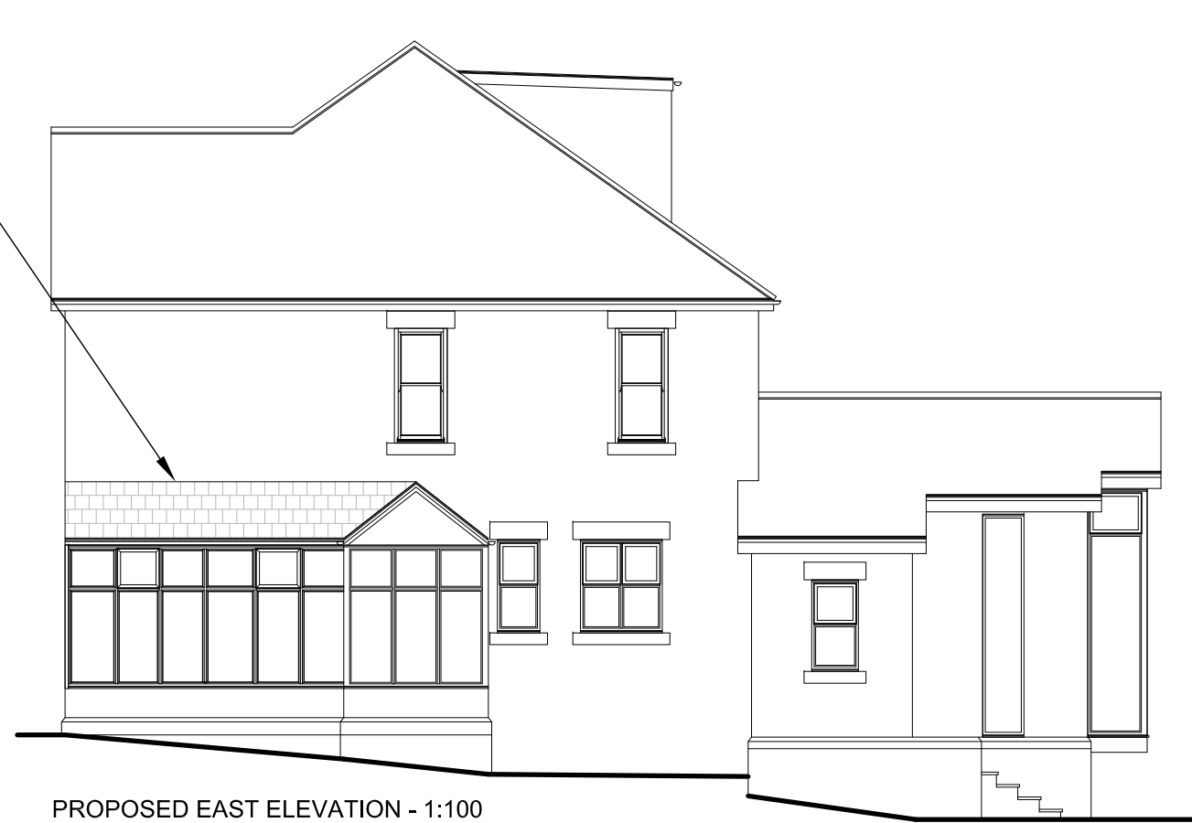
PROPOSED EAST ELEVATION - 1:100