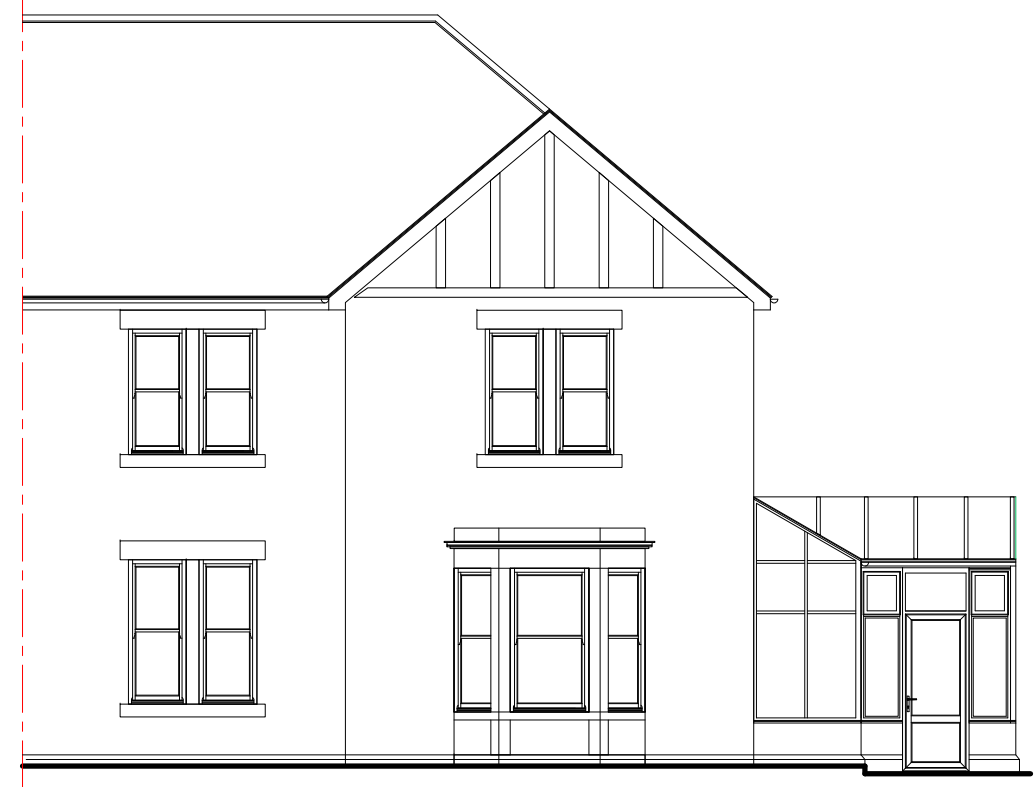
EXISTING SOUTH ELEVATION - 1:100