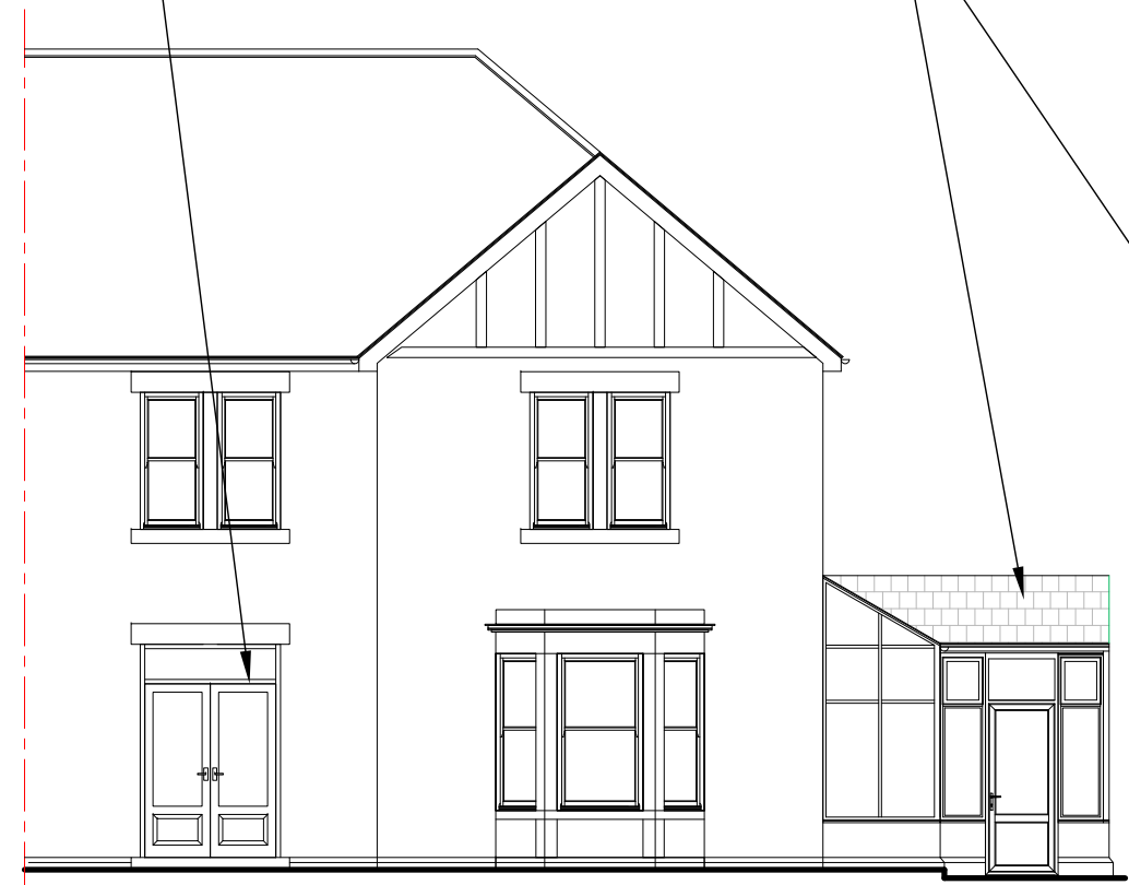
PROPOSED SOUTH ELEVATION - 1:100

Existing uPVC roof to be replaced with new lightweight tiles - 'Guardian Synthetic Slate' in grey