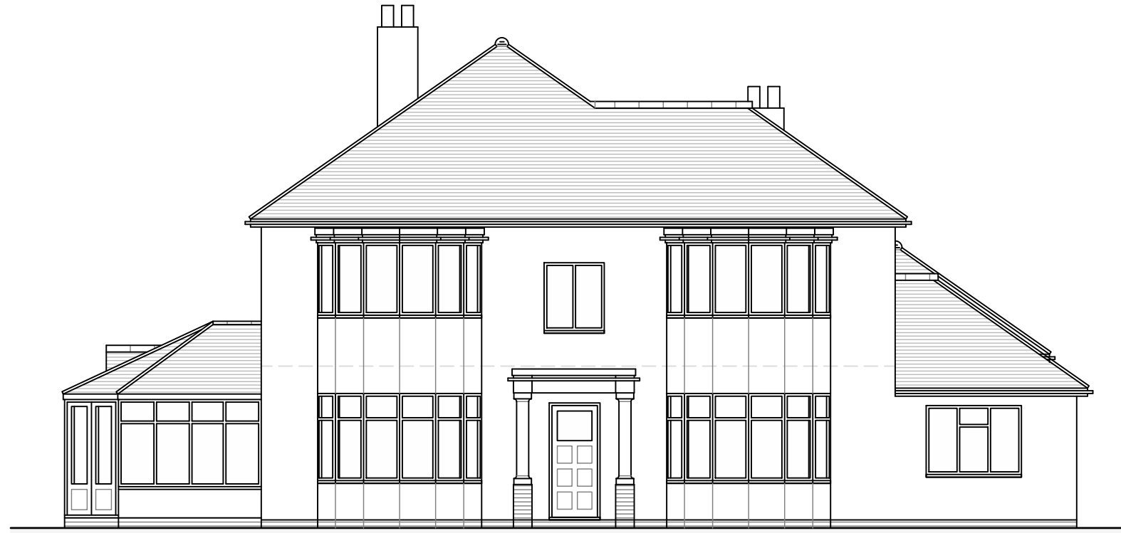
(Principal) South - rear