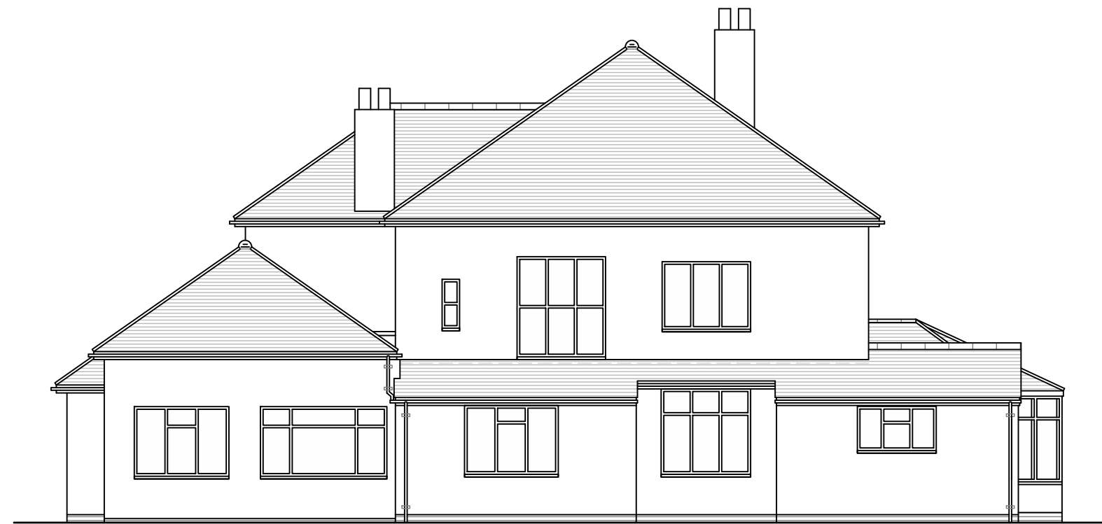
North - front