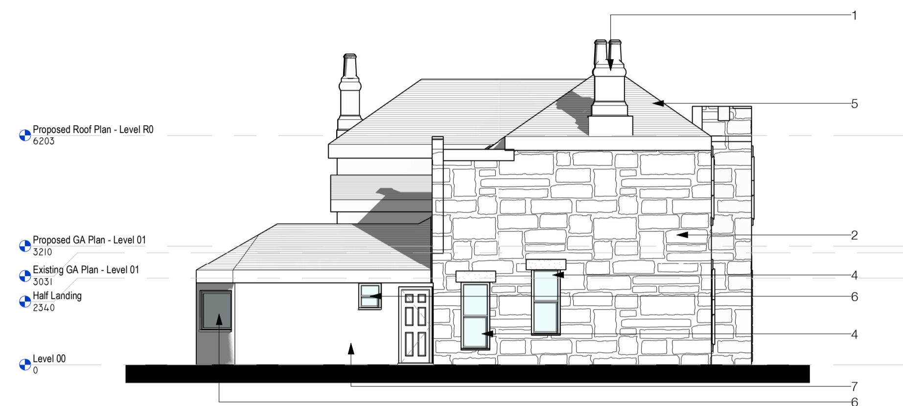
Elevation - East Side 1 : 100