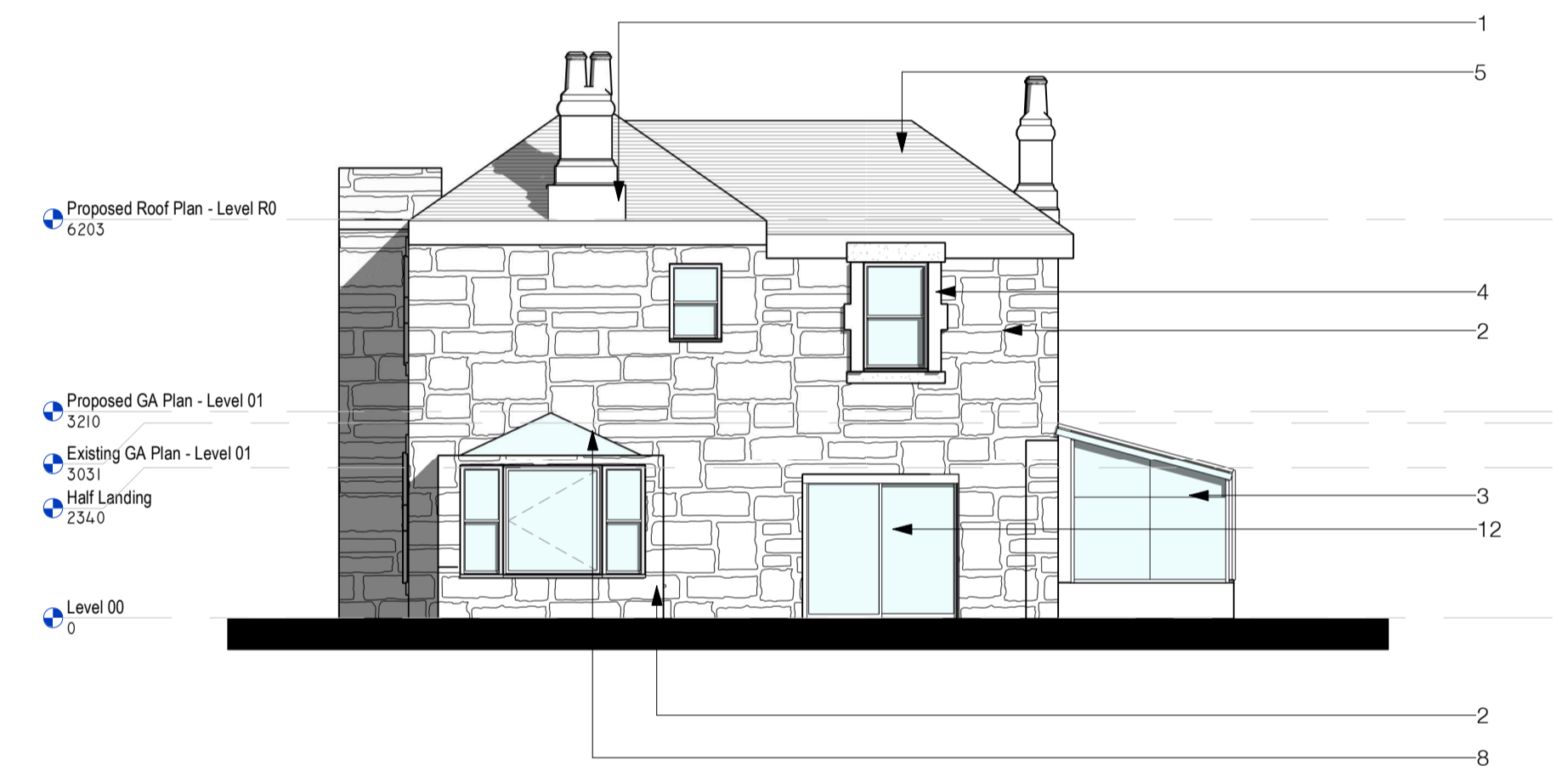
Elevation - West Side 1 : 100