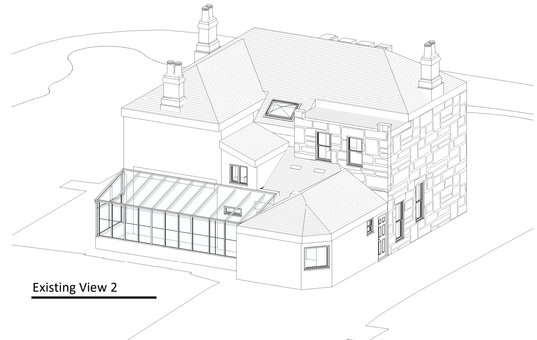
Existing View 2