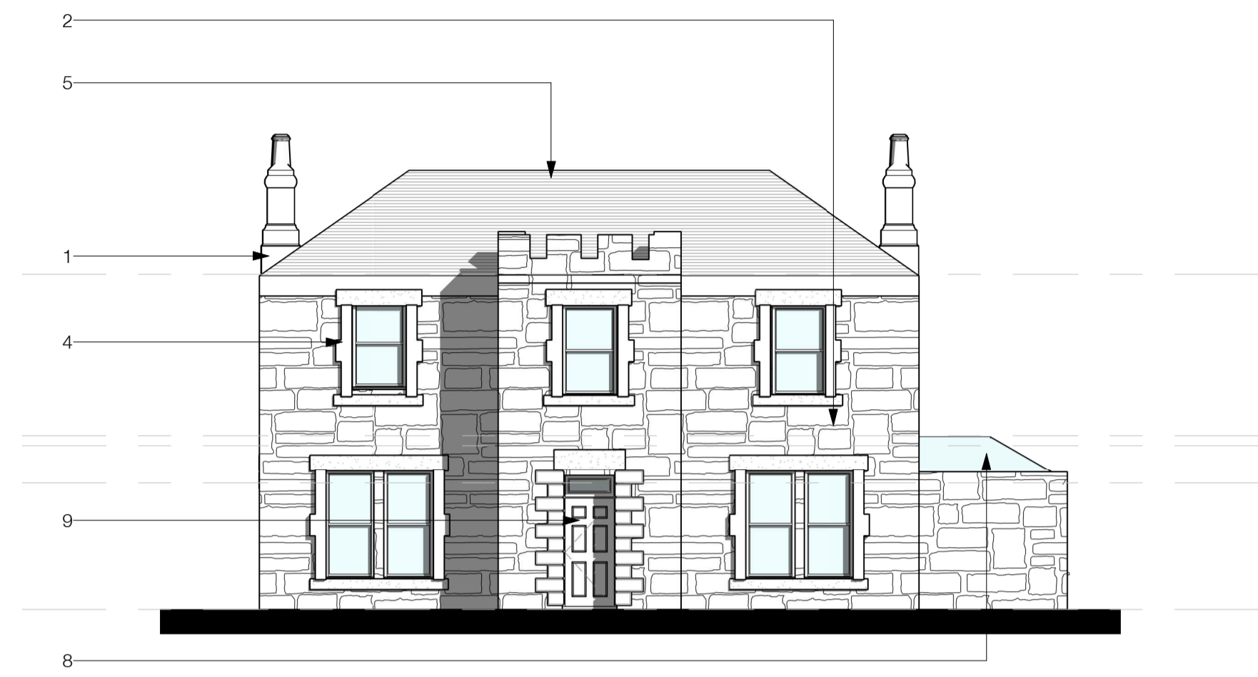
Elevation - Front 1 : 100

Do not scale the drawing. Use figured dimensions in all cases. Check all dimensions on site.